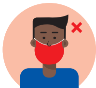
Ffroeni | The sniffer