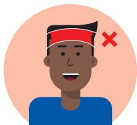
Band gwallt | The headband