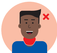
Cynhesu'r gwddf | The neck warmer