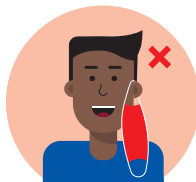
Clustdlws | The earring

O beidio â gwisgo gorchudd wyneb, mae'n bosib na ganiateir i chi barhau â'ch taith.