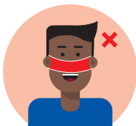
Gwenu | The smiler