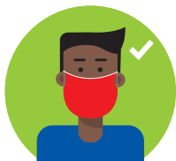
Cywir | Correct

You must wear a face covering on the train for the duration of your journey.